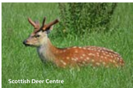
Scottish Deer Centre