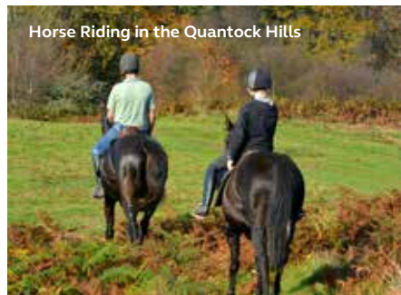
Horse Riding in the Quantock Hills