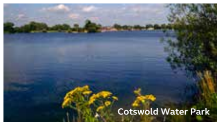
Cotswold Water Park