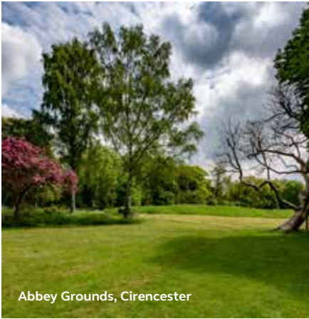
Abbey Grounds, Cirencester