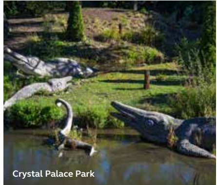
Crystal Palace Park

Crystal Palace Park is not just for dinosaur hunters, there are plenty of pathways throughout the park to enjoy by bike.