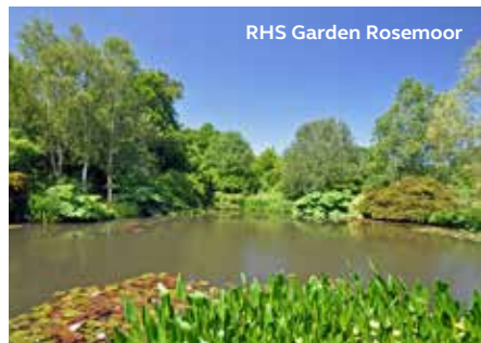
RHS Garden Rosemoor