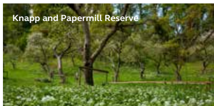
Knapp and Papermill Reserve