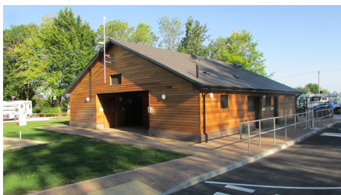
Lower Toilet Block