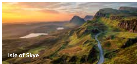
Isle of Skye

Don't forget to check your Great Saving Guide for all the latest offers on attractions throughout the UK. camc.com/greatsavingsguide