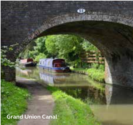
Grand Union Canal