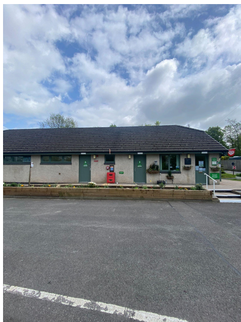
Reception and Toilet Block