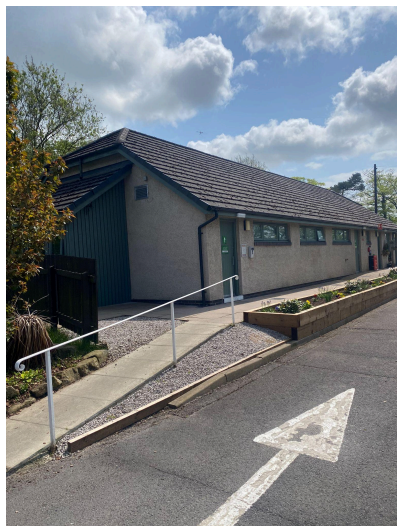
Ramp to Lower Toilet Block