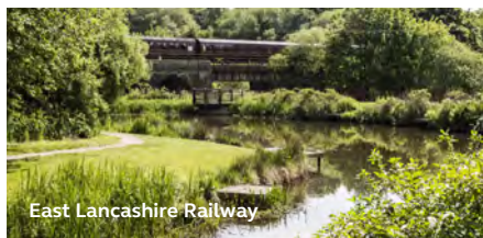
East Lancashire Railway

Don't forget to check your Great Saving Guide for all the latest offers on attractions throughout the UK. camc.com/greatsavingsguide