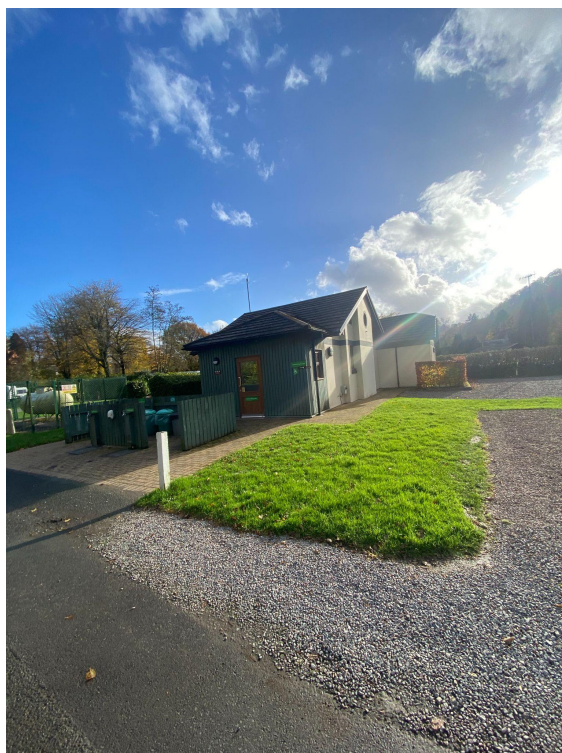
Central Toilet Block