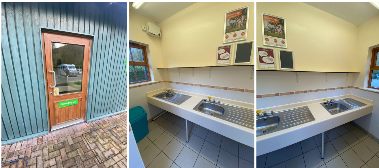
Dishwashing Room - Central Toilet Block