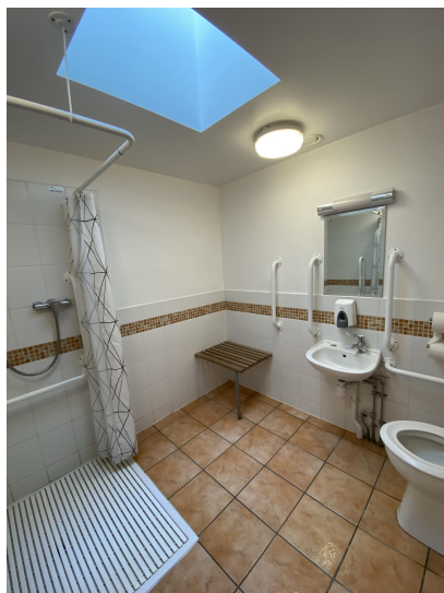
Accessible WC & Shower Cubicle