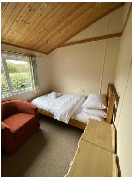
Single Bedroom 1