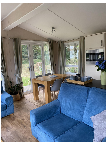
Living Room/Dining Area