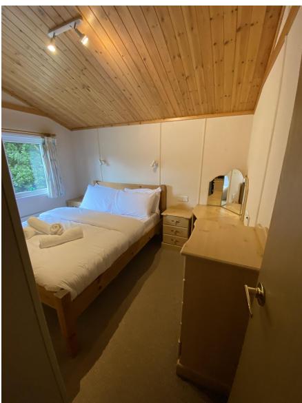
Double Bedroom 2