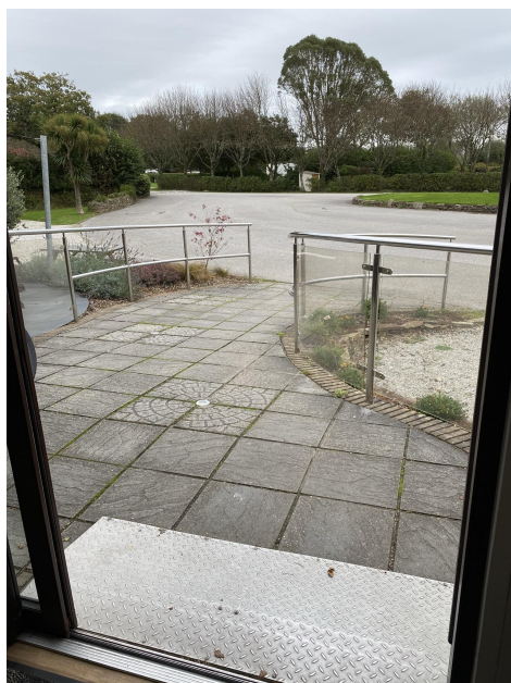
Ramp into Reception