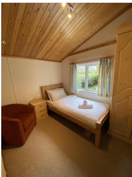
Single Bedroom 2