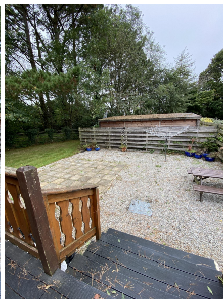
Deck & Backyard