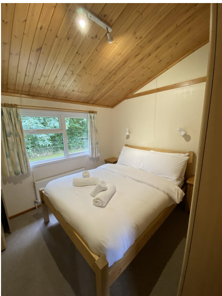
Double Bedroom 1