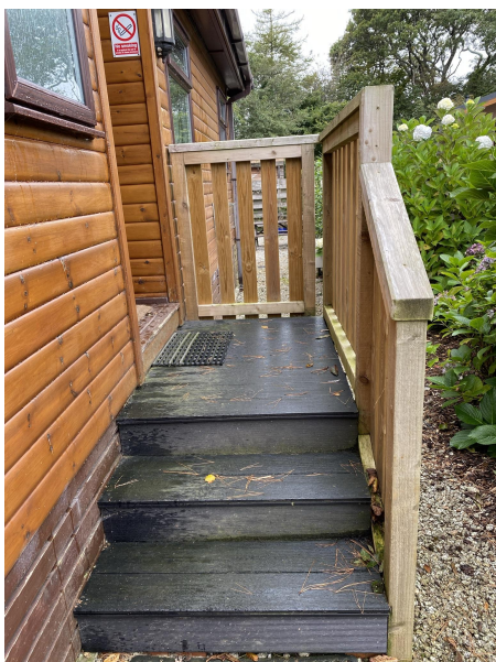
Steps up to the Lodge