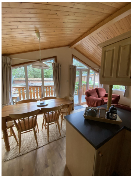
Living Room/Dining Room/Kitchen