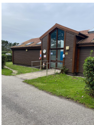
Toilet Block B entrance