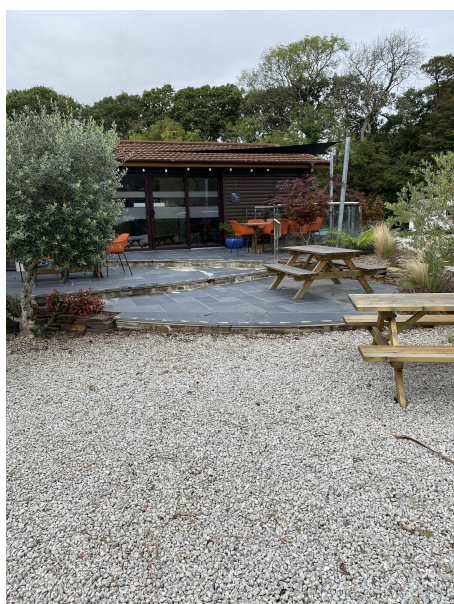
Outside Cafe area