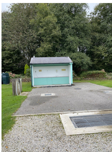
Chemical Emptying Point at Toilet Block C