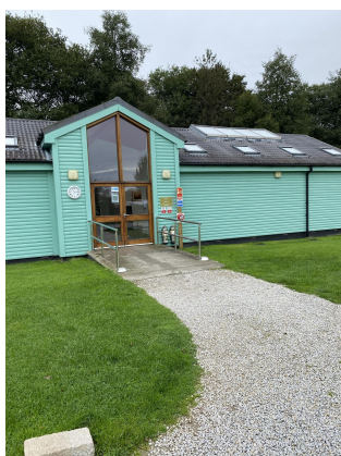
Toilet Block C entrance