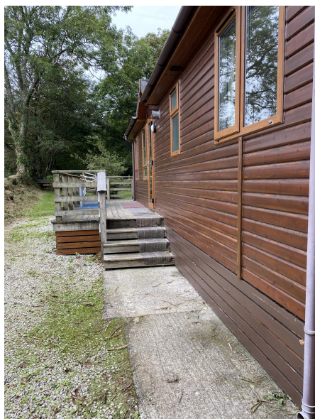
Steps up to the Cabin