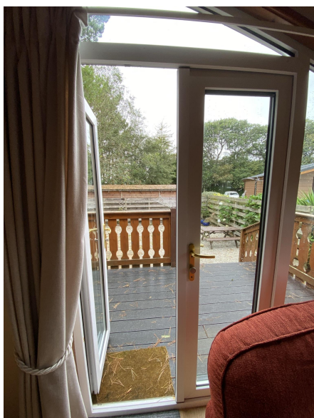
Door to the backyard