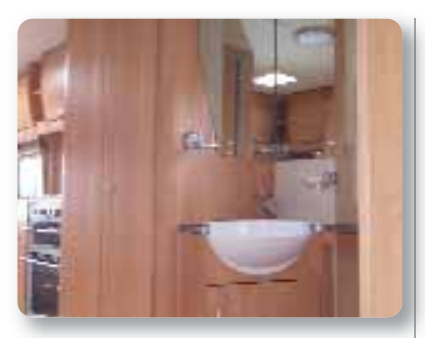
Make and model: Ace Jubilee Aristocrat Year of manufacture: 2008 Current price: £10,995

Clockwise from above: it may be basic, but en suite looks barely used; light cabinetwork looks modern; tidy and clean exterior