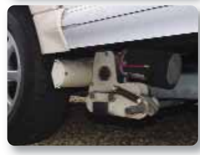
Make and model: Bailey Ranger 540/6 Year of manufacture: 2008 Current price: £9,995

or 10 grand, you get what is effectively a new six-berth caravan. I'd love to know if this Series 5 Ranger has actually ever been used in anger, because it doesn't look like it. Maybe it used to belong to whoever owned the time-warp Abbey...?