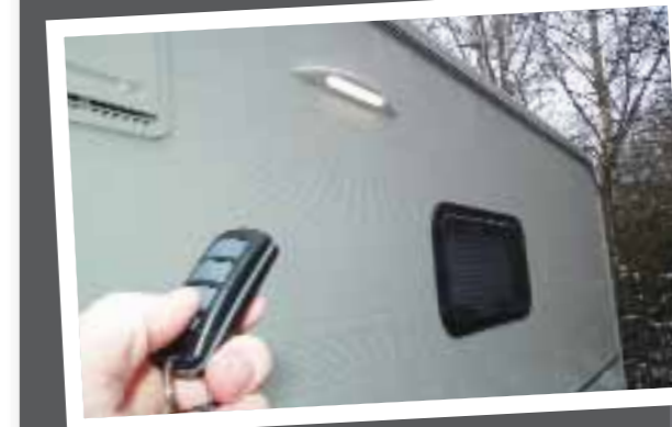
Above top: the Vanmaster can cope with most conditions Above: high-power remote-controlled awning light