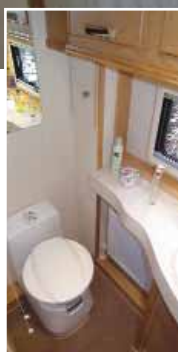
Top: Signature's kitchen unit features lovely contours

“This isn't the biggest washroom, but it is one of the most stylish”