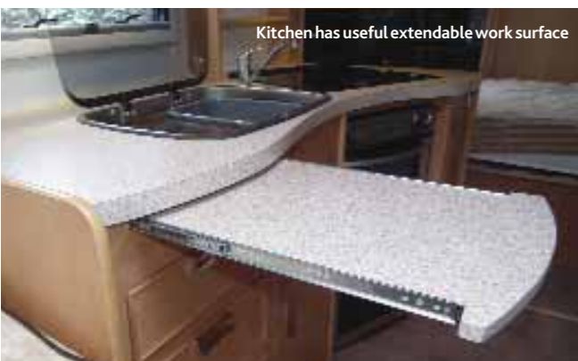
Kitchen has useful extendable work surface

The word that sums it up better than any other is 'solid' – from the massive, one-piece GRP roof and unyielding aluminium sidewalls outside to the chunky ash furniture, laminates and Forth Bridge-like locker stays indoors, solidity is all-pervading. Slide open the drawers, and the only material on view is