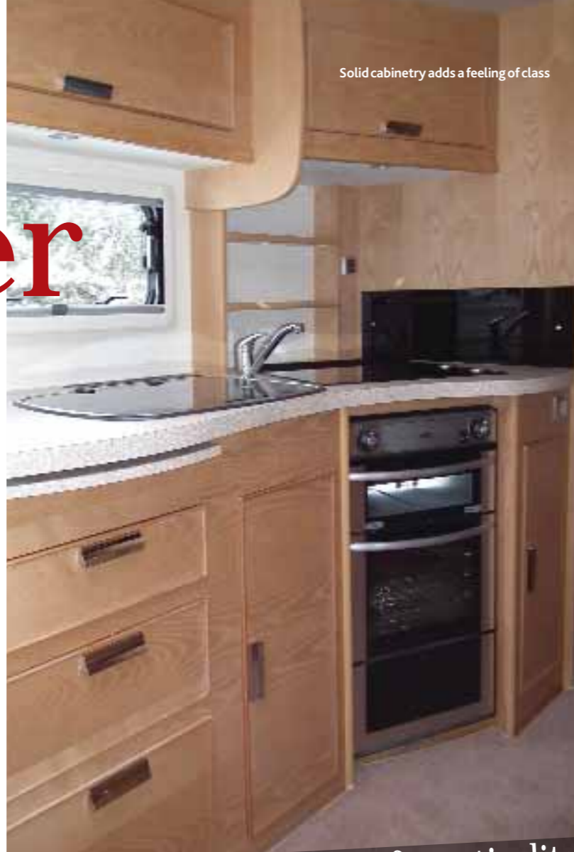
Solid cabinetry adds a feeling of class

“There's no shortage of practicality to go with the opulence”