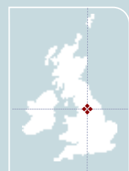
Ordnance Survey Landranger Map 104

6 When you get to the path junction, turn right (signposted 'Strid Shop and Car Park'). At the T-junction, turn right following a yellow arrow. Walk past the toilets and retrace your steps to the site.