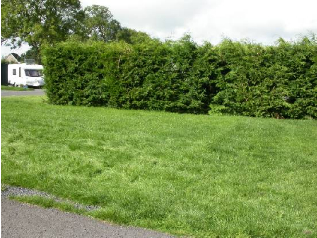
Figure 2: Leylandii hedge in centre of site.