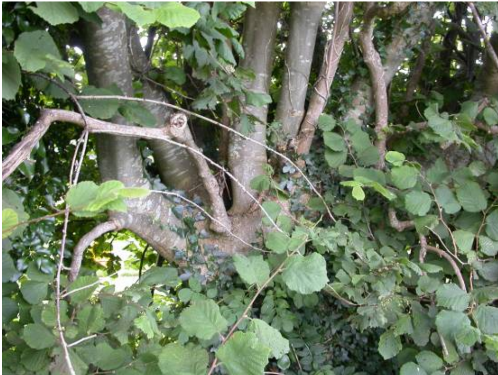
Figure 4: Hazel with many large steps where previously it had been cut several time around the same point.