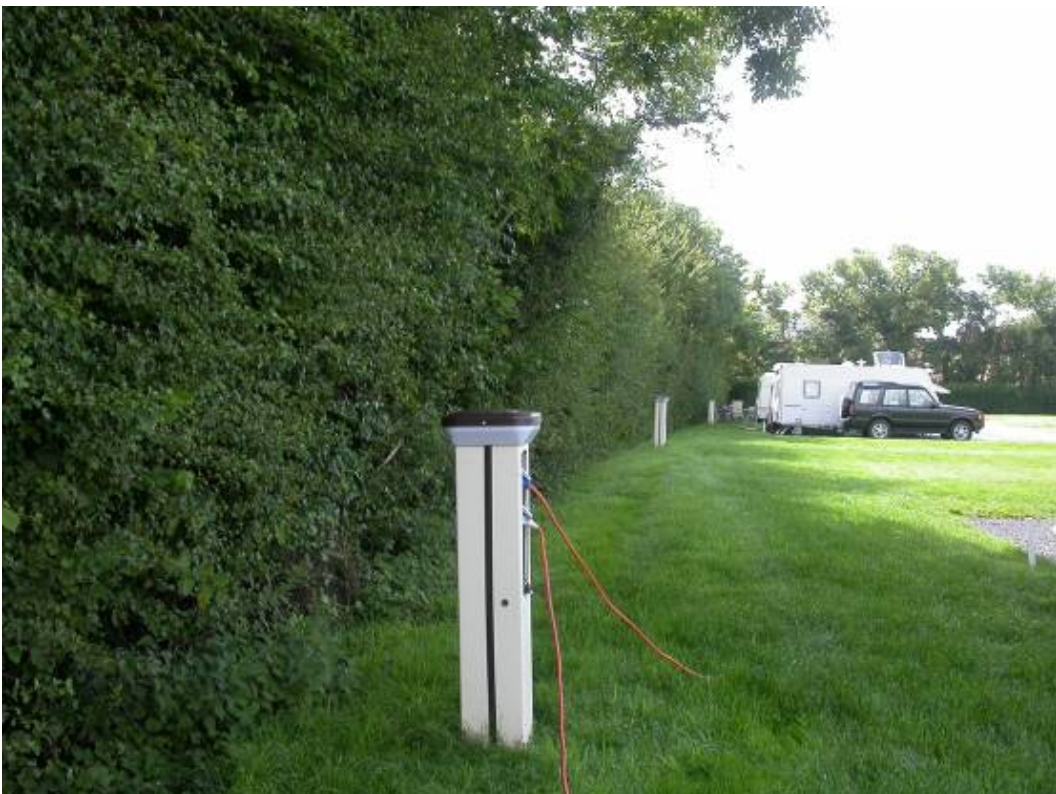
Figure 3: Hedge along eastern side of site looking south.