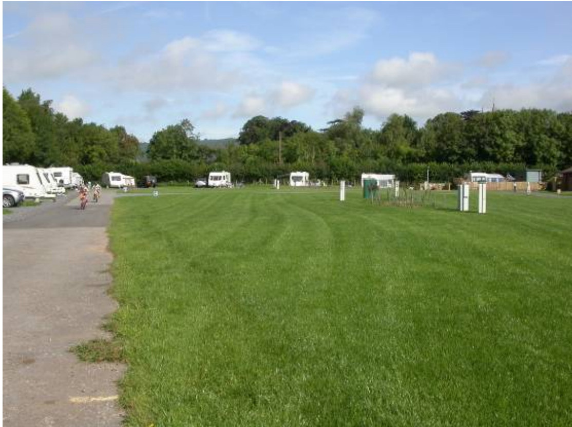
Figure 1: View of typical short mown amenity grassland on site