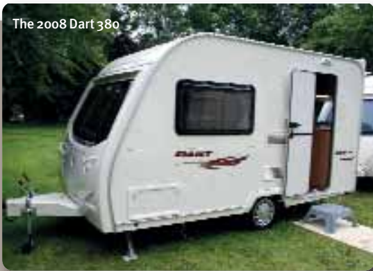
The 2008 Dart 380