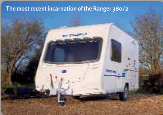
The most recent incarnation of the Ranger 380/2