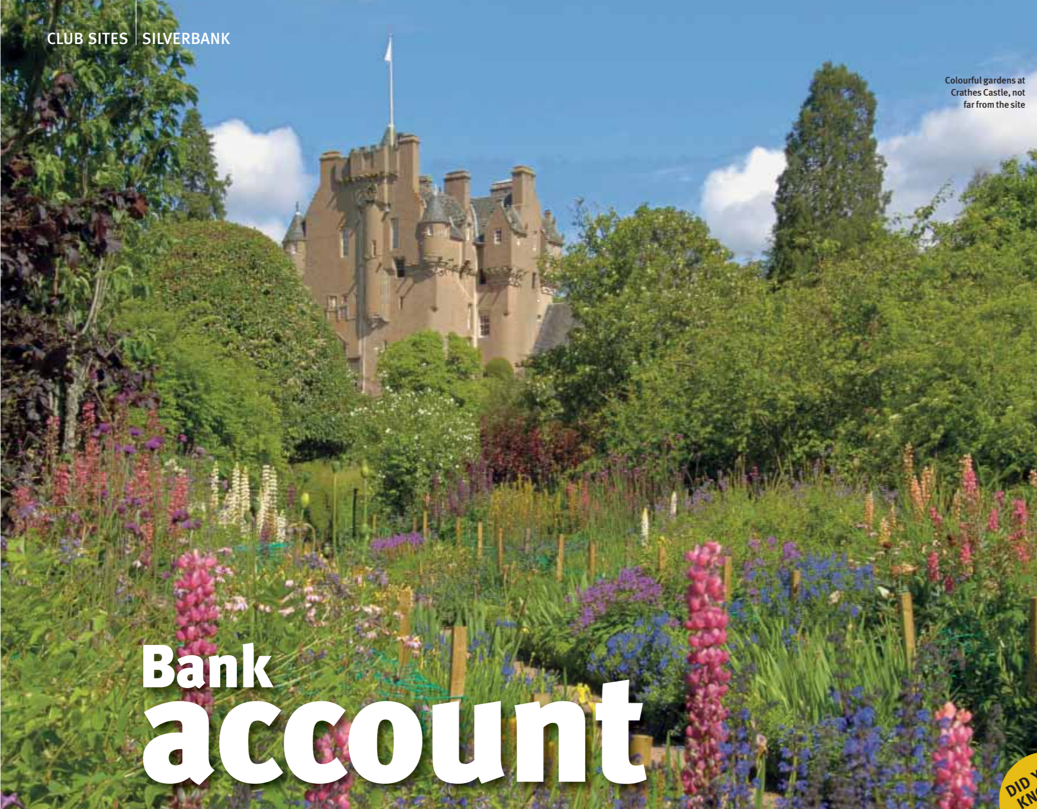
Colourful gardens at Crathes Castle, not far from the site