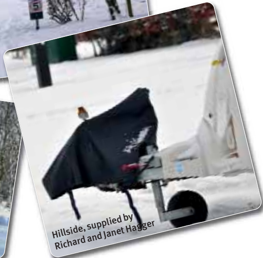
Hillside