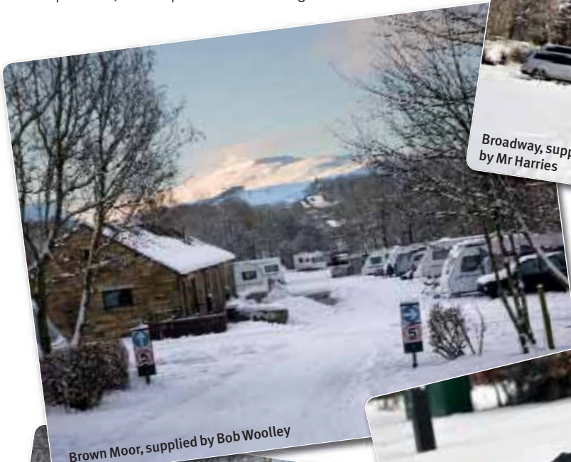
Brown Moor

Many of the pictures were accompanied by stories from members who said they had embraced the cold weather by building snowmen. Several, like the wardens at Craigie Gardens in Ayr, even held barbecues and served hot mulled wine! As promised, we have put a selection of images on the website.