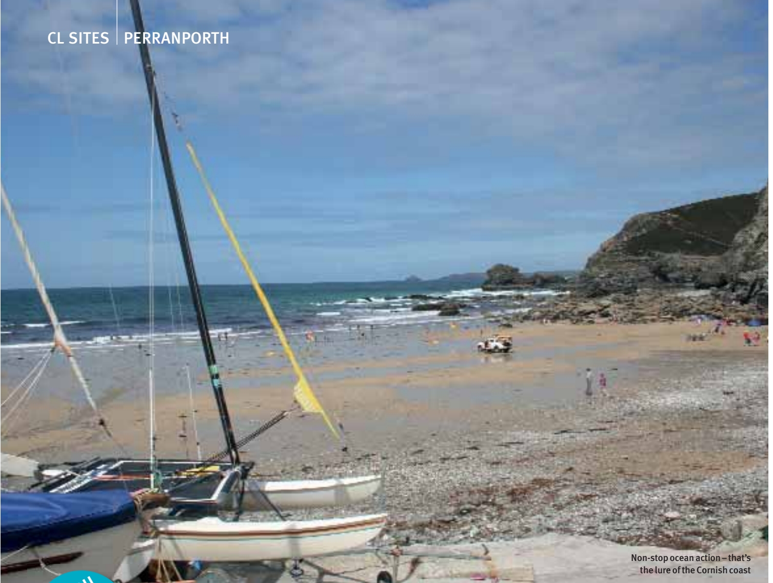
Non-stop ocean action – that's the lure of the Cornish coast