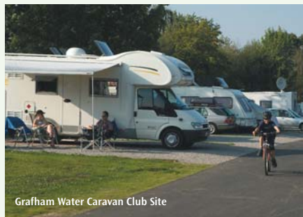
Grafham Water Caravan Club Site

The Caravan Club is run by members for members and is not motivated by profit. We happily offer free advice and help to all our members and the staff at head office and Club Wardens are on hand to help you on all caravanning matters. We rely on members to help us maintain The Club as an unequalled organisation offering the best value, quality and support.