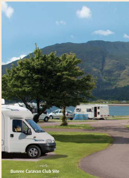
Bunree Caravan Club Site

Not only is the Club investing in new Club Sites, but many of the existing Sites have been extensively re-developed.