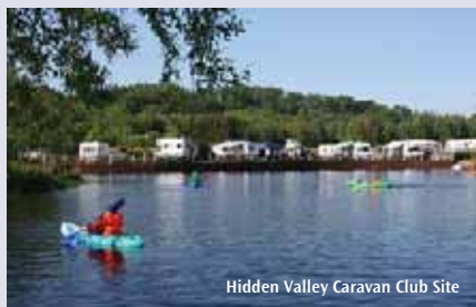
Hidden Valley Caravan Club Site

The Club continues to invest in existing sites with improvements planned at Southland, Looe and Cirencester amongst others. The Club has also made its largest ever investment in redeveloping a site, with the £2.6m refurbishment at Park Coppice. More hard-standings on many sites support the growing popularity of winter touring – 50 Club Sites are now open all year.