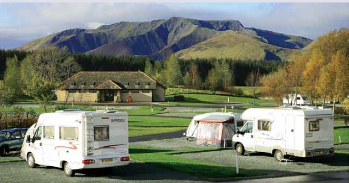
Troutbeck Head Caravan Club Site, one of The Club's eight sites in Cumbria