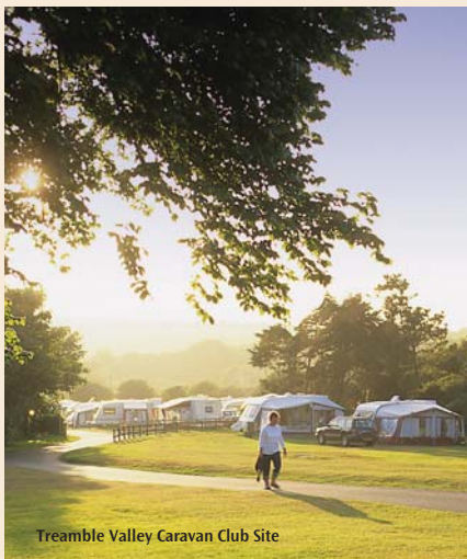
Treamble Valley Caravan Club Site

We are sure you will notice the difference throughout the coming year, and trust you will enjoy staying at our great new Teesdale Barnard Castle Club Site, which is due to open in August 2010.