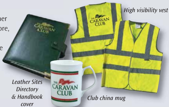
Leather Sites Directory & Handbook cover

By phone on 0845 2415 753 (Mon to Sat 9am – 6pm)