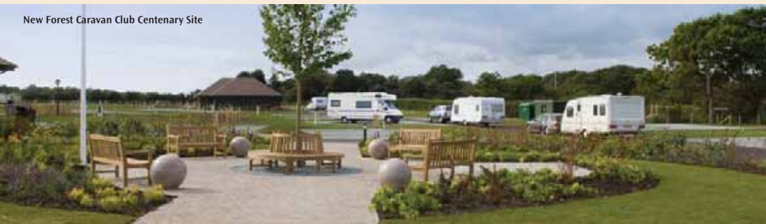
New Forest Caravan Club Centenary Site