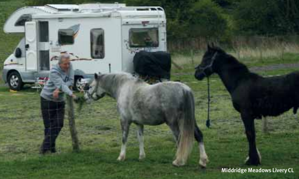
Middridge Meadows Livery CL