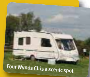
Four Wynds CL is a scenic spot