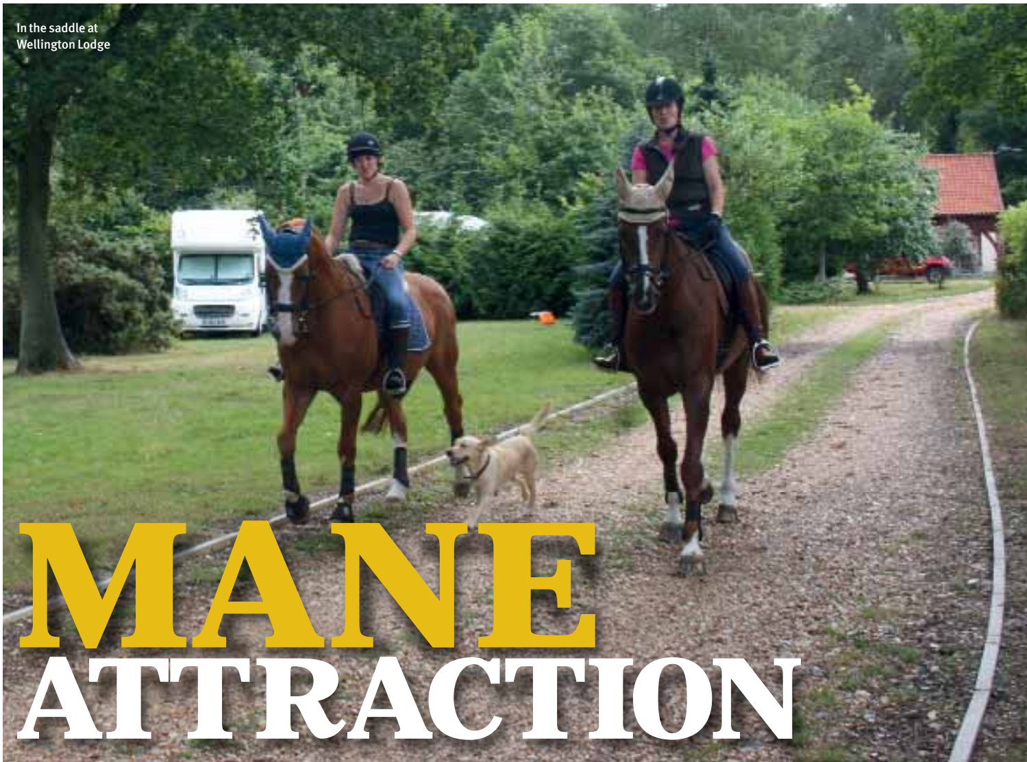
In the saddle at Wellington Lodge