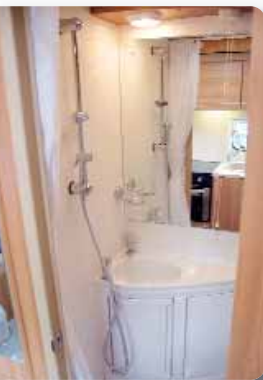
Washroom is a generous 3ft 8in x 2ft 7in

A long mirror features on the double-doored wardrobe, while the stepped interior (concealing the gas locker) offers a 39in drop from the hanging rail.