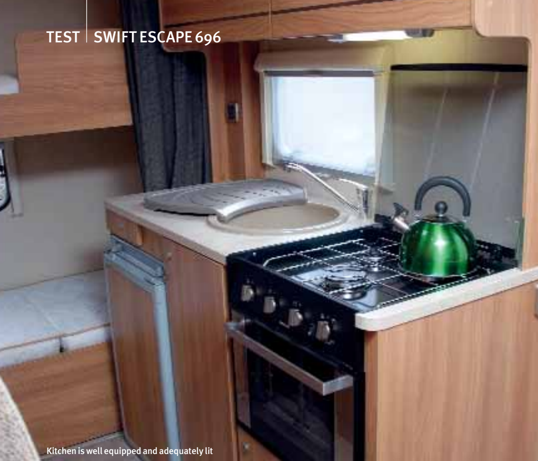
Kitchen is well equipped and adequately lit