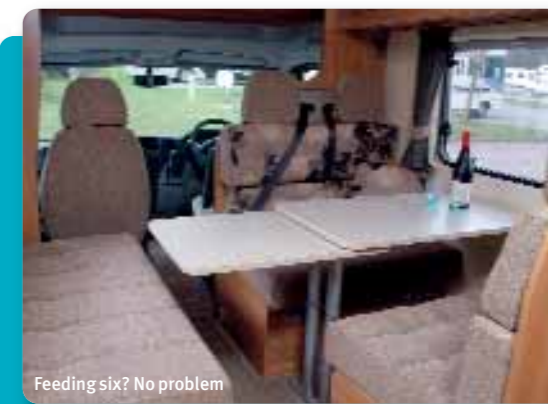
Feeding six? No problem

For clothes storage, there are three top lockers over the offside dinette and two opposite, but only one per side is shelved. However, being Swift's modular lockers with injection-moulded inner frames, shelf supports are already there should you wish to add more. The flat locker doors have an aluminium-effect trim and positive-locking catches operated by a concealed central trigger behind the bottom edge. >>