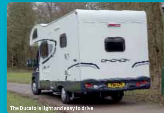
The Ducato is light and easy to drive

“Swift has made this model family friendly from bumper to bumper”