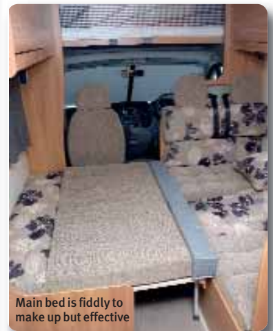
Main bed is fiddly to make up but effective

Storage is generous, comprising a shelved cupboard under the sink and a generous roof locker above the toilet. Fittings include a toothbrush mug and towel/tissue holders. There's no window but a rooflight provides light and air. The single 4½in halogen light is