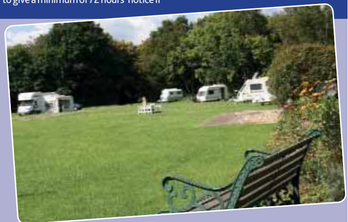
Cae Mawr (top) in Wales and Broomfield Farm (above) in Sussex are just two sites on the Club's extensive network

NOT A MEMBER? A copy of this magazine is posted every month to all members of The Caravan Club as part of the annual subscription – currently £42. For more details of all the benefits of Club membership, call 01342 318813 or see caravanclub.co.uk