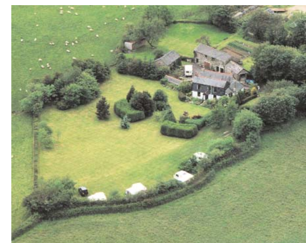
ABOVE LEFT: Shoulthwaite Farm CL ABOVE RIGHT: Tremarkyn CL, Liskeard BELOW: Red Rocks Fishery, Preston

If you are interested in setting up a CL, inevitably there are financial implications. Good gateway access, reasonably level