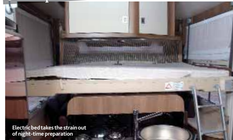
Electric bed takes the strain out of night-time preparation

“...the electric bed is an example of simple, robust engineering”