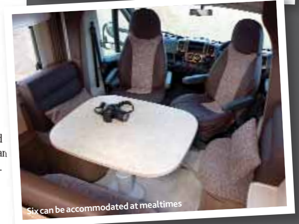
Six can be accommodated at mealtimes