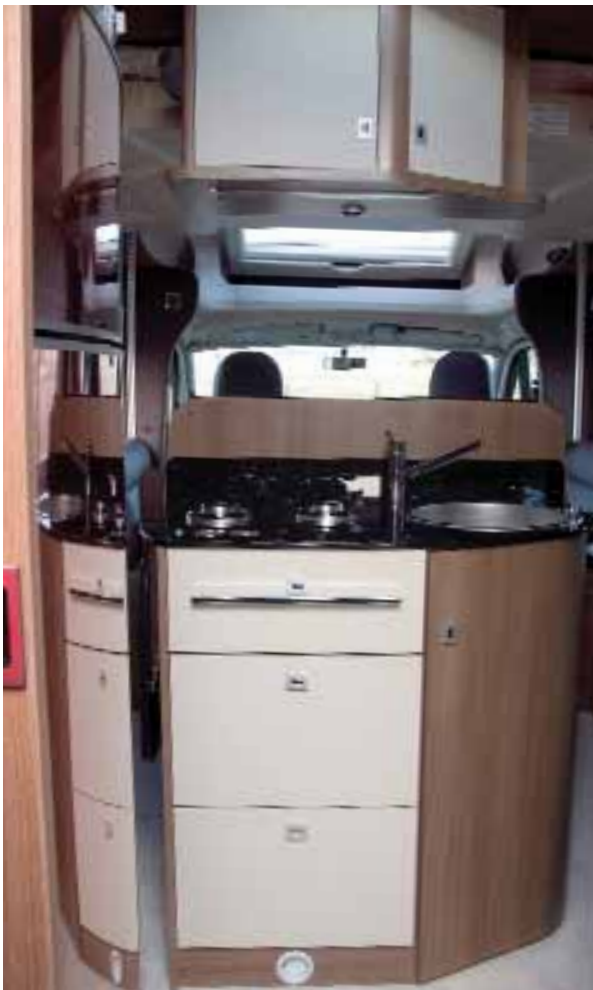
Above: the Suite's kitchen combines style with practicality