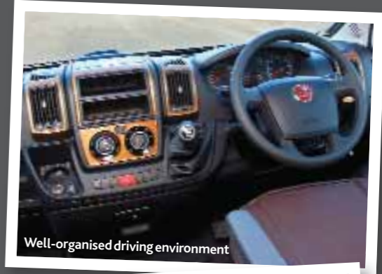
Well-organised driving environment

Hot water is courtesy of a Truma G/E Boiler located under the front nearside seat. Controls are located with those for the