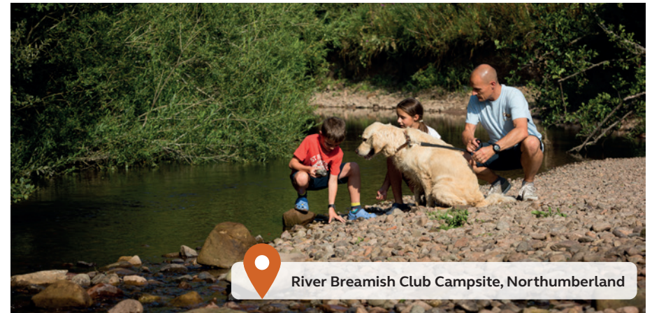
River Breamish Club Campsite, Northumberland