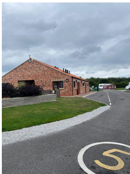
Toilet Block B