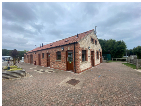
Toilet Block A