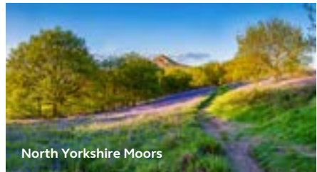
North Yorkshire Moors

Cinder Track is a 21-mile route which begins in Scarborough and takes in Hayburn Wyke, Robin Hood's Bay and Larpool Viaduct before ending in Whitby. This is a part of National Cycle Route 1.