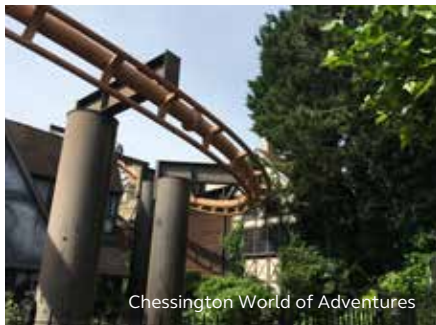
Chessington World of Adventures