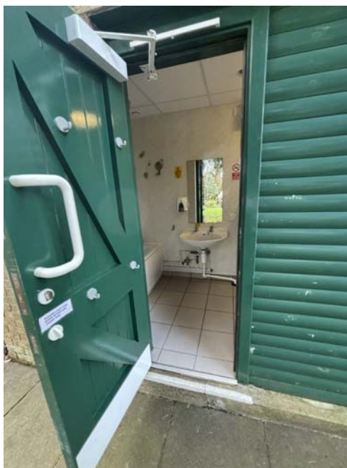
Baby and Toddler Room