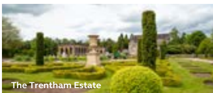
The Trentham Estate

Don't forget to check your Great Saving Guide for all the latest offers on attractions throughout the UK. camc.com/greatsavingsguide