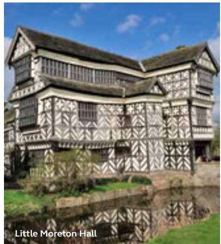
Little Moreton Hall