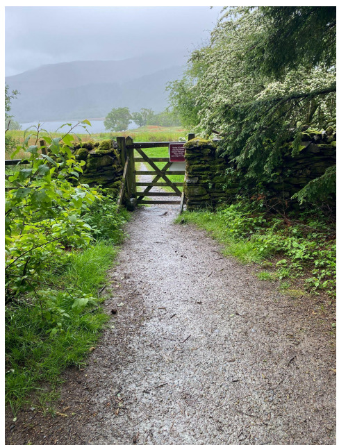
Path to Dog Walk