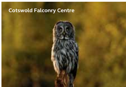
Cotswold Falconry Centre