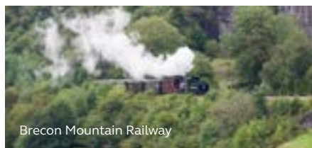
Brecon Mountain Railway

Don't forget to check your Great Saving Guide for all the latest offers on attractions throughout the UK. camc.com/greatsavingsguide