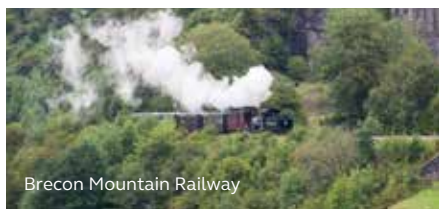
Brecon Mountain Railway

Don't forget to check your Great Saving Guide for all the latest offers on attractions throughout the UK.