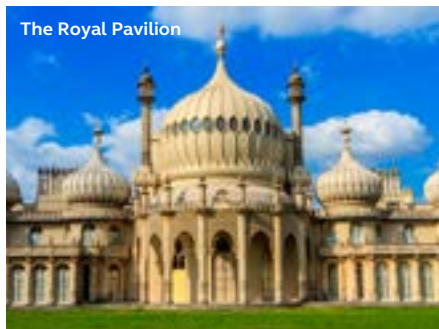
The Royal Pavilion

Don't forget to check your Great Saving Guide for all the latest offers on attractions throughout the UK.