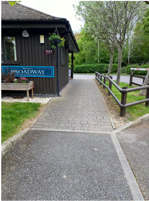
Entrance to reception