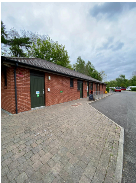
Main Toilet Block