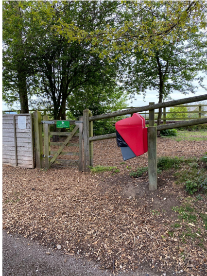
Top Dog Walk