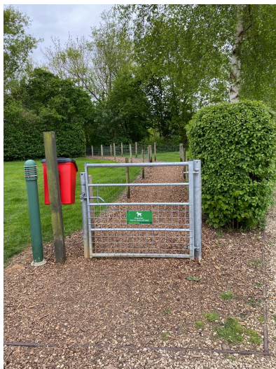
Bottom Dog Walk