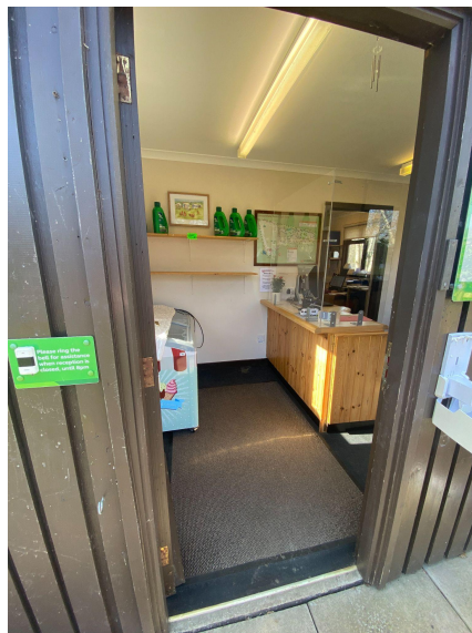
Entrance to Reception