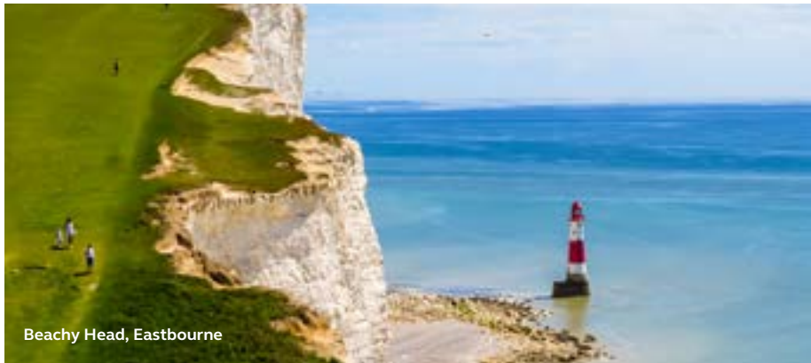
Beachy Head, Eastbourne

Connects East Hoathly and Chiddingly, both with interesting churches and well placed pubs.