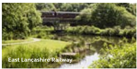
East Lancashire Railway

Don't forget to check your Great Saving Guide for all the latest offers on attractions throughout the UK. camc.com/greatsavingsguide