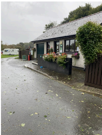
Entrance to Reception