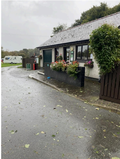
Entrance to Reception