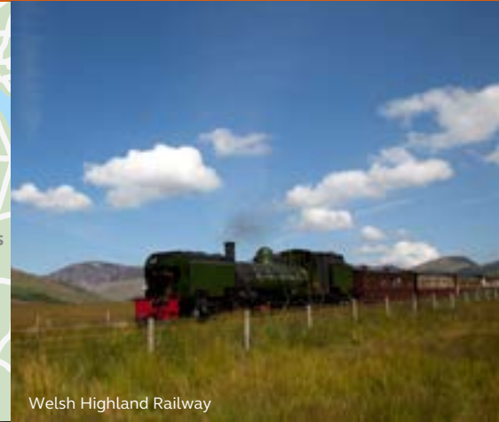
Welsh Highland Railway