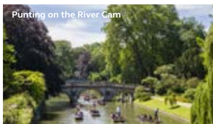
Punting on the River Cam