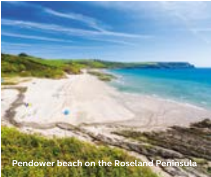
Pendower beach on the Roseland Peninsula