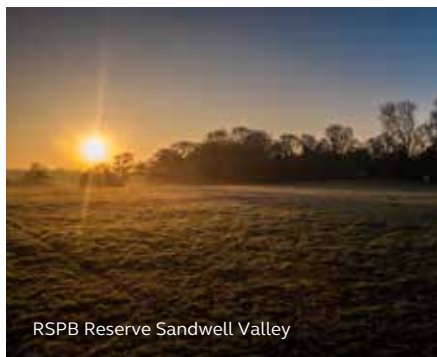
RSPB Reserve Sandwell Valley