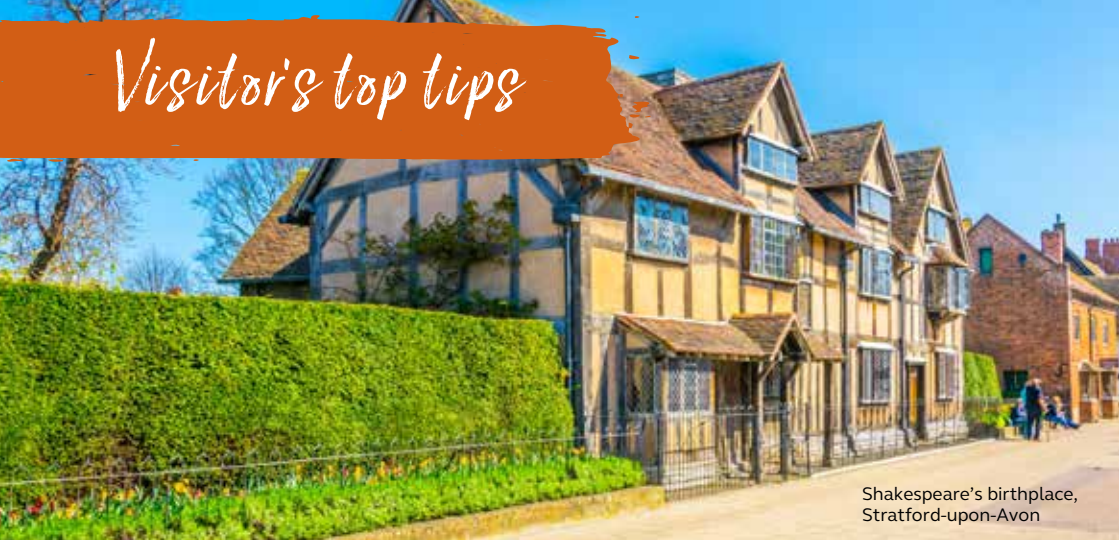
Shakespeare's birthplace, Stratford-upon-Avon

Becketts Farm Shop and Restaurant is a 10 minute walk and worth a visit. They serve great breakfast, plus Members receive 10% discount.