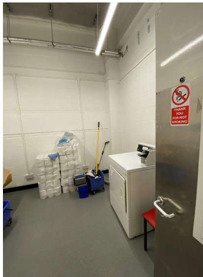
Tumble Dryer Room