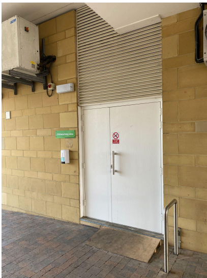
Door to Dishwashing and Laundry Facilities