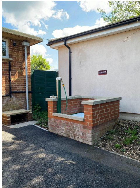
Chemical Waste Point