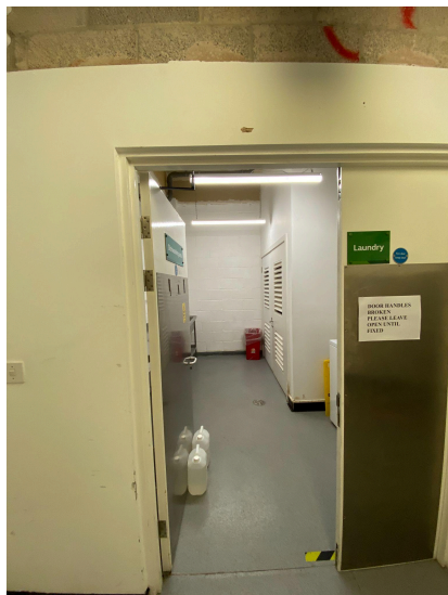
Dishwashing and Washing Machine Room