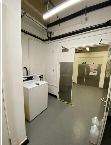
Dishwashing and Washing Machine Room