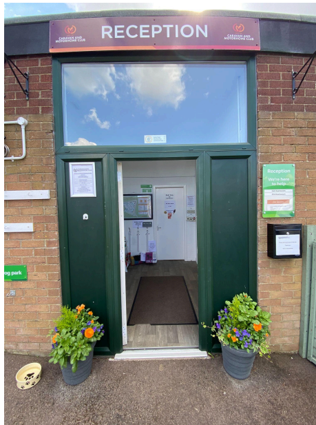
Entrance to reception